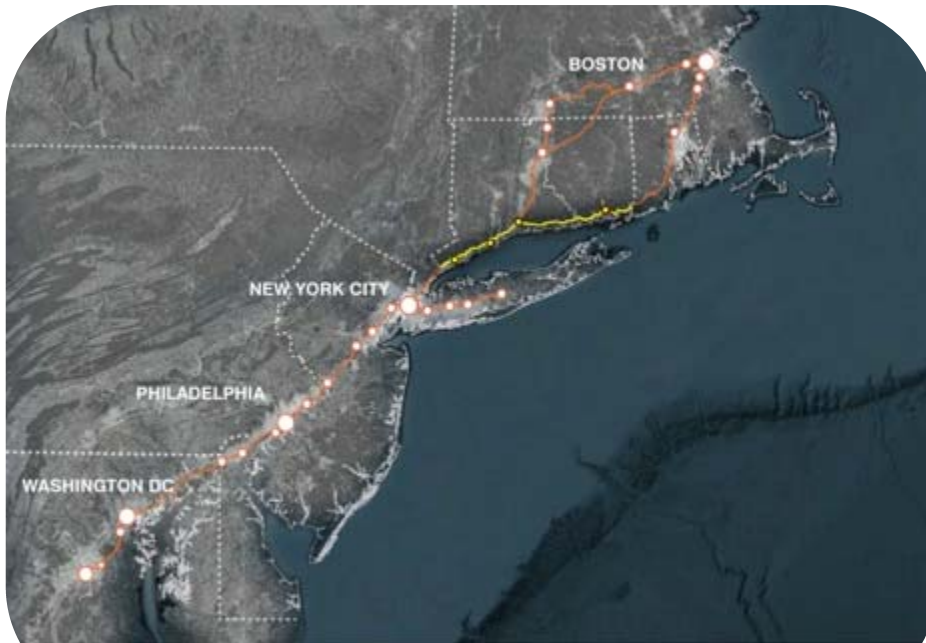
NORTHEAST REGIONAL CORRIDOR