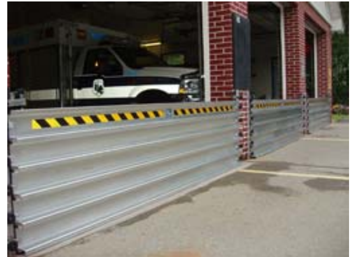
Closure Device (Opening Barrier), Certified Platinum Level