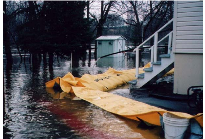
Temporary (Perimeter) Barrier, Certified Silver Level